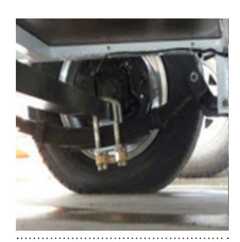
Suspension & Brakes