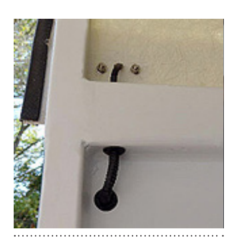
All wires that run through chassis are grommeted