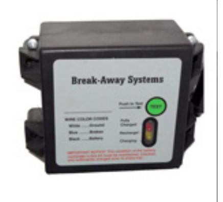
Electronic brake safety breakaway system